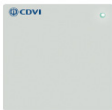
AP22 Kit available with 2 readers