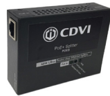
POE Network Injector Splitter and Bracket