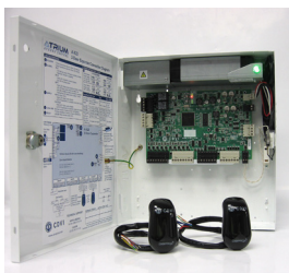
A22POE Also available in white